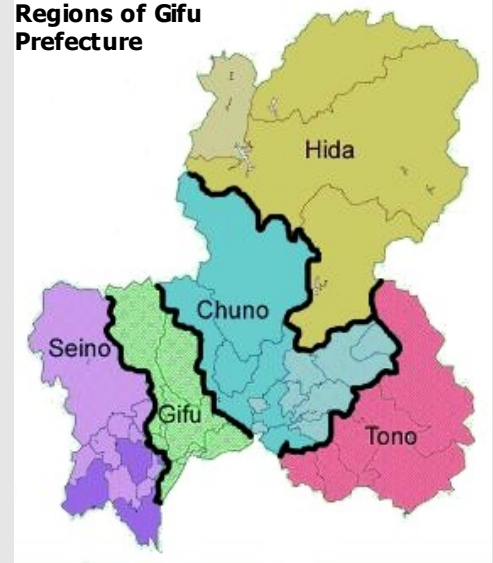
Regions of Gifu Prefecture

Number of JETs/English speaking foreigners in same town